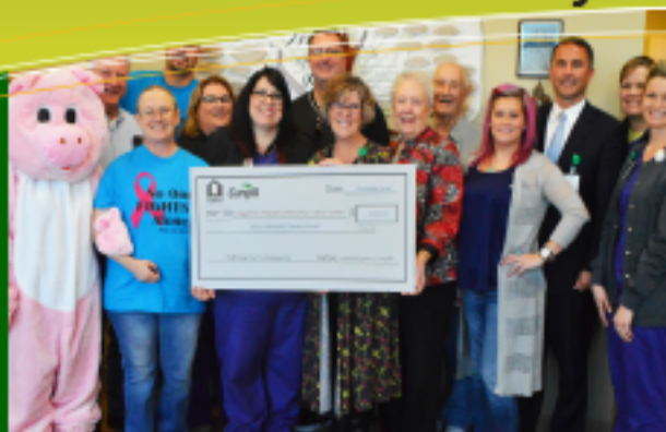
Representatives from Ashford Agency and Cargill Meat Solutions present a $3,027 check raised during the 2018 Pig Out for Pink Out lunch.