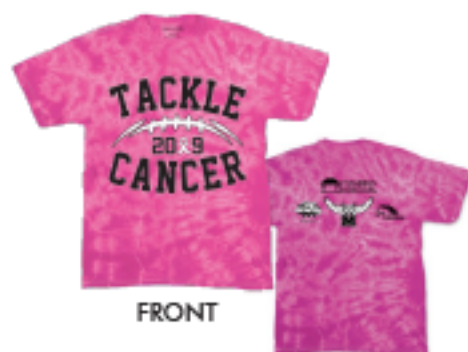
T-shirt color: Fuchsia FRONT BACK

Proceeds to benefit Community Cancer Center patients' needs.